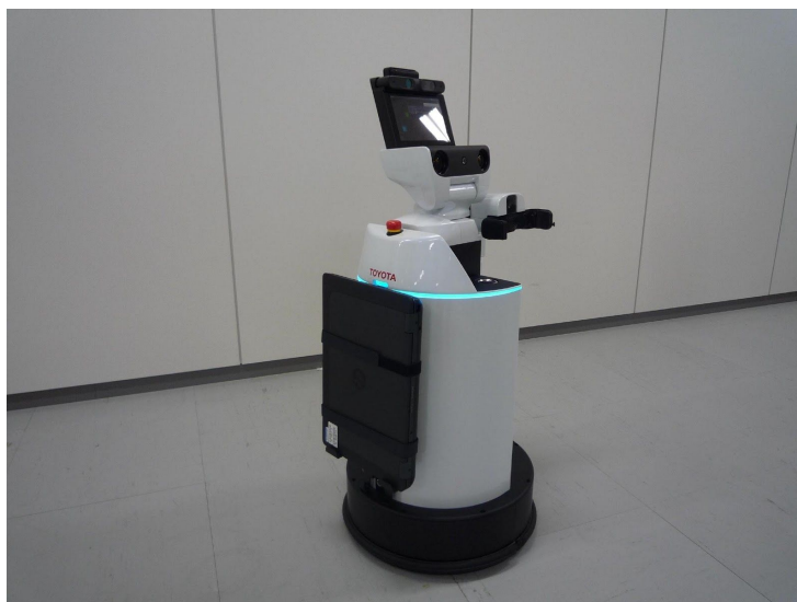
Figure 3.1: TOYOTA HSR Mounting Bracket

The referees may run random checks anytime during the competition prior to the test to verify that the laptop in the TOYOTA HSR Mounting Bracket has no additional hardware plugged in, and matches the authorized specifications.